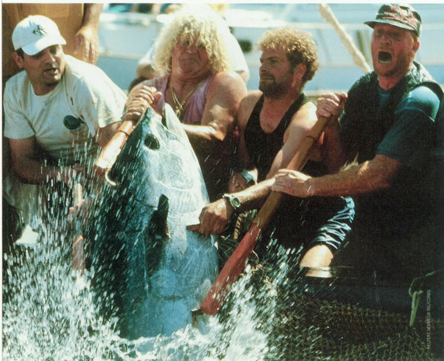
Free-range sushi. Fishermen off the coast of Favignana, Sicily, haul a tuna from their nets. Many such outfits are backed by Japanese capital.

Atlantic bluefin tuna ("ABT" in the trade) are a highly migratory species that ranges from the equator to Newfoundland, from Turkey to the Gulf of Mexico. Bluefin can be huge fish; the record is 1,496 pounds. In more normal ranges, 600-pound tuna, 10 feet in length, are not extraordinary, and 250- to 300-pound bluefin, six feet long, are commercial mainstays.