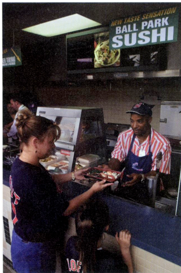
A dash of civilizations

Outside of Japan, tuna, especially raw tuna, hasn’t always had it so good. Sushi isn’t an easy concept to sell to the uninitiated. And besides, North Americans tend to think of cultural influence as flowing from West to East: James Dean, baseball, Coca-Cola, McDonald’s, and Disneyland have all gone over big in Tokyo. Yet Japanese cultural motifs and material—from Kurosawa’s The Seven Samurai to Yoda’s Zen and Darth Vader’s armor, from Issey Miyake’s fashions to Nintendo, PlayStation, and