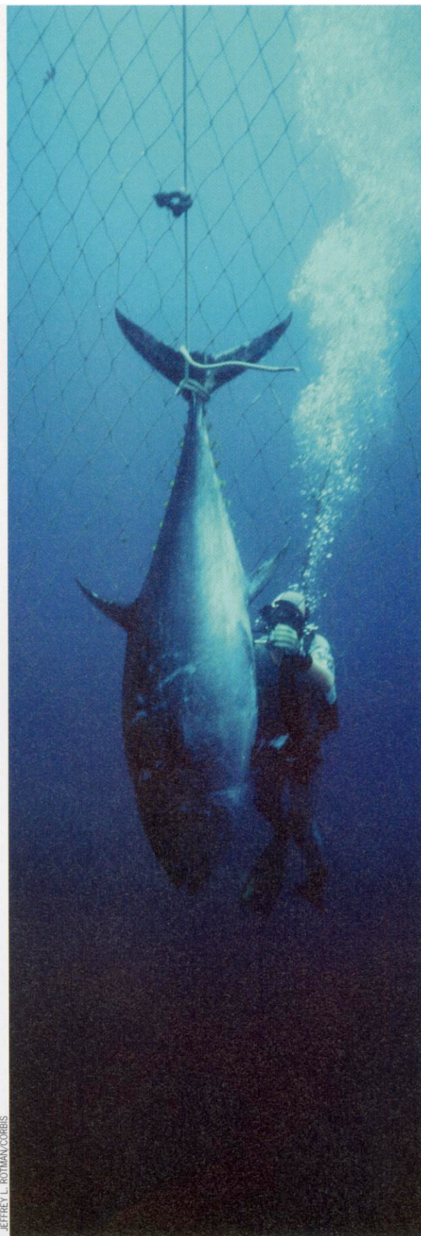
Liquid assets: A diver ropes a bluefin tuna caught in a net.

On the docks, too, Japanese cultural control of sushi remains unquestioned. Japanese buyers and "tuna techs" sent from Tsukiji to work seasonally on the docks of New England laboriously instruct foreign fishers on the proper techniques for catching, handling, and packing tuna for export. A bluefin tuna must approximate the appropriate kata , or "ideal form," of color, texture, fat content, body shape, and so forth, all prescribed by Japanese specifications. Processing requires proper attention as well. Special paper is sent from Japan for wrapping the fish before burying them