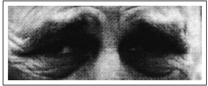
Figure 1. Sample item from the empathic accuracy measure (Baron-Cohen et al., 2001). The response options were terrified, upset (correct), arrogant, and annoyed.

Verbal knowledge. A large subset of participants ( n = 63 ) completed 29 items from the vocabulary subtest of the Wechsler