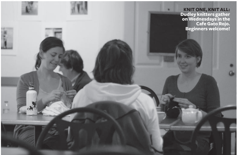
KNIT ONE, KNIT ALL: Dudley knitters gather on Wednesdays in the Café Gato Rojo. Beginners welcome!

Sunday, May 2, 8 a.m. Meet at the Dudley steps. Raise money to end hunger and walk with Team Dudley. The Walk is 20 miles long and starts from Boston Common. You may wish to walk part of the way or all the way. Every mile, every volunteer counts! Contact Dudley Public Service for more information.