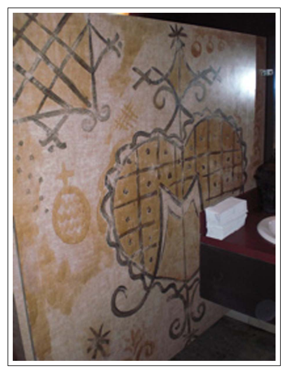
Figure 2. Vèvè painted on a toilet stall of Muriel's, New Orleans, LA. The ornate heart is a vèvè for the spirit Ezili Freda.

confusing, one often finds terms such as Vodou, Voodoo and Hoodoo used interchangeably, with little consideration paid to how these might differ. Such distinctions matter little to shop owners and barkeepers whose primary interest in Vodou is as a marketable commodity. Tourists come to New Orleans in part to be shocked by the presence of