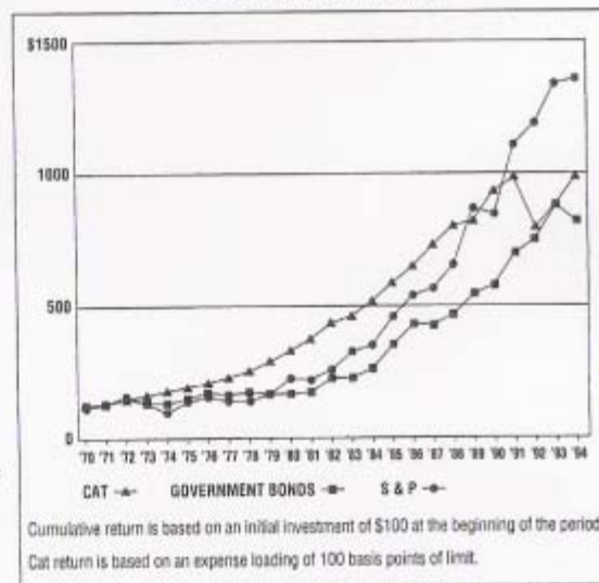
Figure 1. Cumulative returns on alternative asset classes.

Taken together, Figures 1 and 2 suggest that cat risk investments on average earned returns substantially in excess of Treasury bills during this period, much like investments in stocks and bonds. Cat investments appear somewhat less volatile than these other asset classes, but still have large downsides should a serious event occur. 8