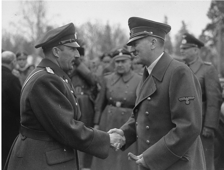
Figure 1: Adolf Hitler greets Bulgaria's King Boris III in Berlin.

Tripartite Pact. On March 1, 1941 Bulgaria officially entered the war on the side of the Axis Powers.