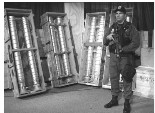
P-1 centrifuges recovered in Libya, similar in design to Iran's centrifuges at Natanz. Note the difference in scale from the gaseous diffusion units.

Cold Standby. As with Portsmouth, cold standby would involve shutting down the cascade, with efforts to maintain as much ability to restart as possible. Iran shut down the centrifuges that were already in place during the previous suspension, but there is little public data concerning what efforts, if any, Iran took to maintain restart capabilities during that period.