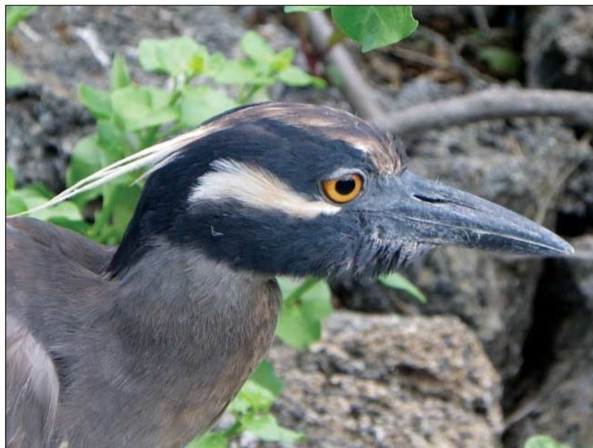
Yellow-crowned night heron—Galapagos Islands.