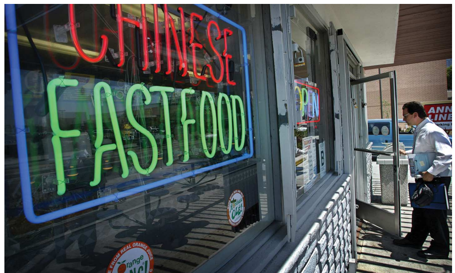
Fig. 1. What is the best way to allocate food-safety inspectors?

In another resource allocation example, it is common in industry to use SML to predict the probability of customer “churn,” in which a customer abandons a company or service, and the company responds by allocating interventions