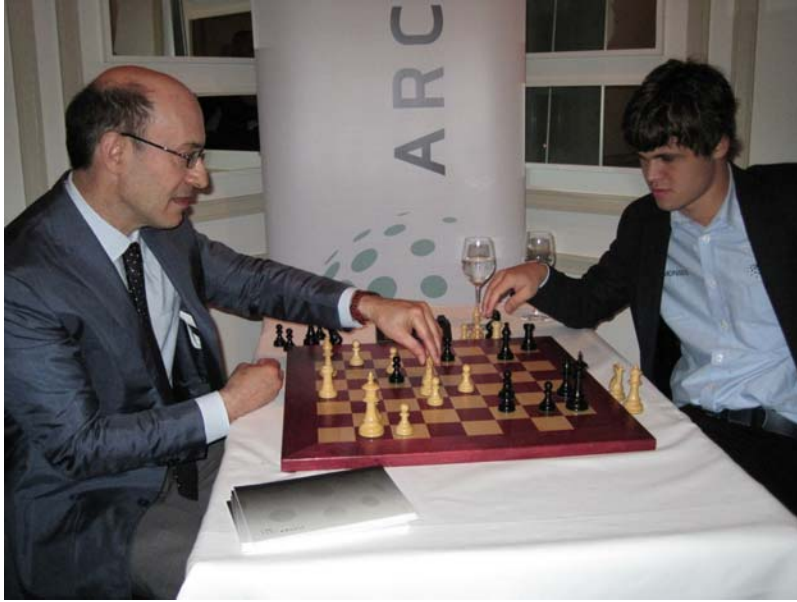
Friendly analysis after the game.