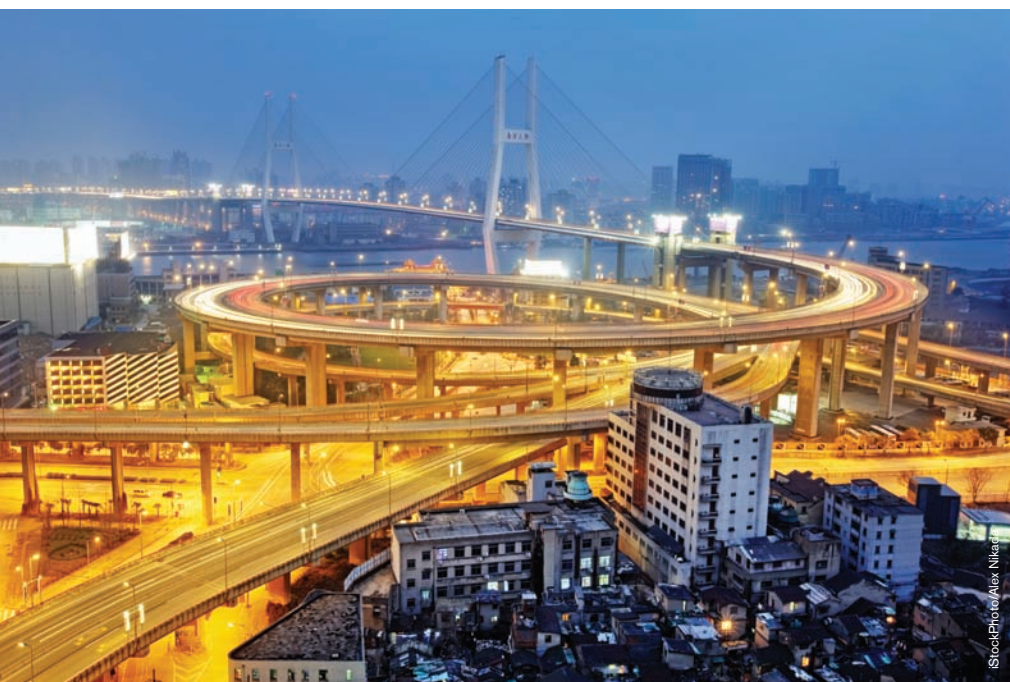
China, one of the biggest emitters of GHGs, was constrained in its position at Copenhagen by domestic pressures surrounding economic growth.

13. The G-20 turned its attention to climate change policy, from a nearly exclusive focus on finance, in its Pittsburgh meeting in September 2009.