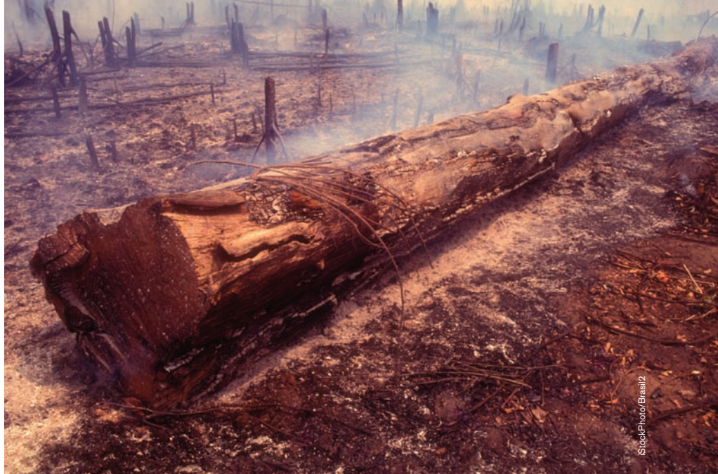
Logging in Amazon Rainforest.

There are three relevant regimes in the Accord. First, emissions reductions (and financing to developing countries) by Annex I countries will be subject to international guidelines, which “will ensure that accounting of such targets and finance is rigorous, robust and transparent.” Second, non-Annex I countries undertaking actions with no external financing “will be subject to their domestic measurement, reporting and verification, the results of which will be reported through their [N]ational [C]ommunications every two years... with provisions for international consultations and analysis under clearly defined guidelines that will ensure that national sovereignty is respected.” Third, non-Annex I countries undertak-