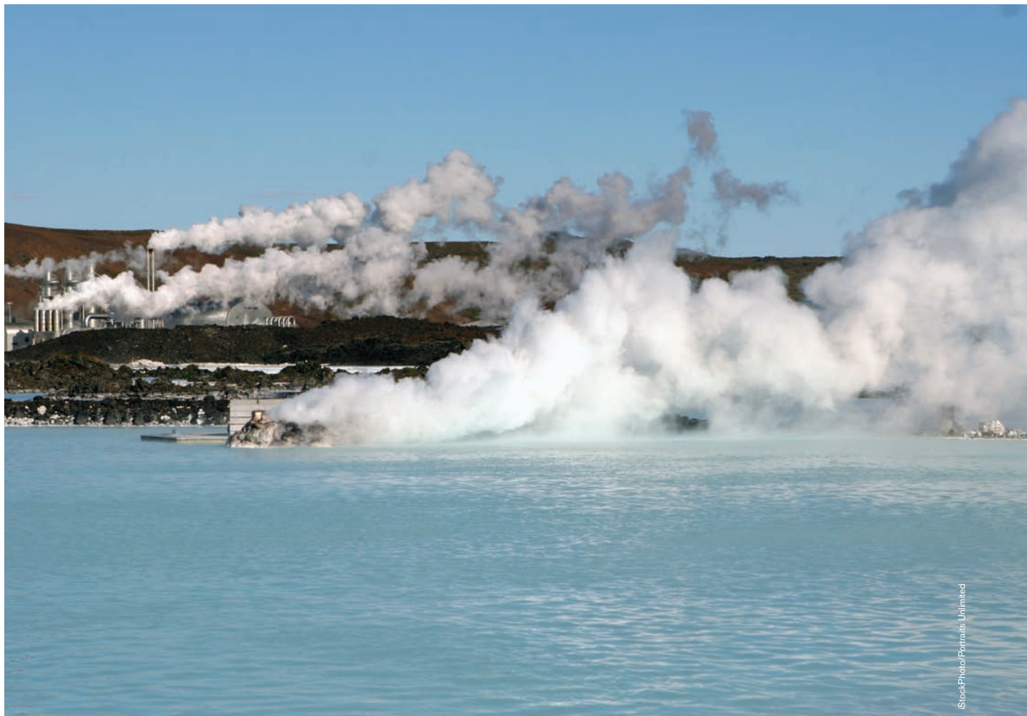
A powerplant in Iceland. The accord states that "deep cuts in global emissions are required" to stabilize greenhouse gas concentrations such that global average temperature increases by less than 2°C.

The original, stated purpose of COP-15 had been to complete negotiations