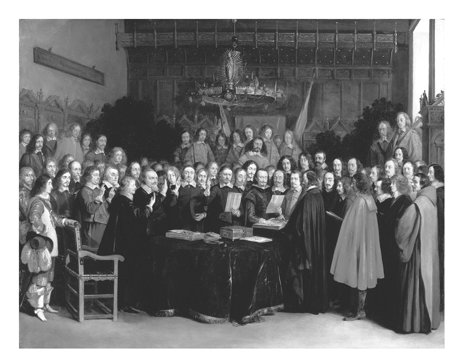
FIGURE 0.3: Gerard ter Borch, The Ratification of the Treaty of Münster (1648).

also the neighbouring Kingdoms, and France particularly, have been involv'd in the Disorders of a long and cruel War" ("Treaty of Münster" 1648, Preamble and Art. 1). One could perhaps be deceived by the stated aim of the agreement to establish a "Christian and universal peace, and a perpetual, true and sincere amity," but that was a standard rhetorical device used in most treaties of the time (ibid.). But what historical sovereignty may lose in mythical prestige, it gains in authenticity, detail, and interest.