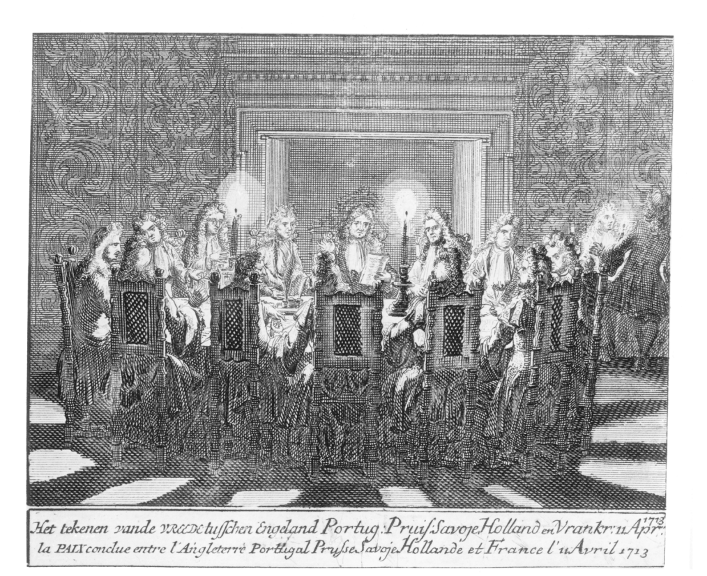
FIGURE 0.5: Delff, The Signing of the Treaty of Utrecht on 11th April 1713 . Private Collection.

as well as codification. Conversely, it may seem counter-intuitive that war, by nature a chaotic activity where nothing is certain beyond the fact that it has been declared, would become such a ritualized duel between states. War and peace, under the inspiration of philosophers and lawyers, thus became legal constructs with their modus operandi , regulations and norms, which were generally respected by belligerents (Koskenniemi in this volume). In the end, the only purpose of the law of nations was to bring more order in the interrelations of states on the continent and, as such, it was a factor contributing to peace on the continent—or at least to attempt to make wars less cruel.