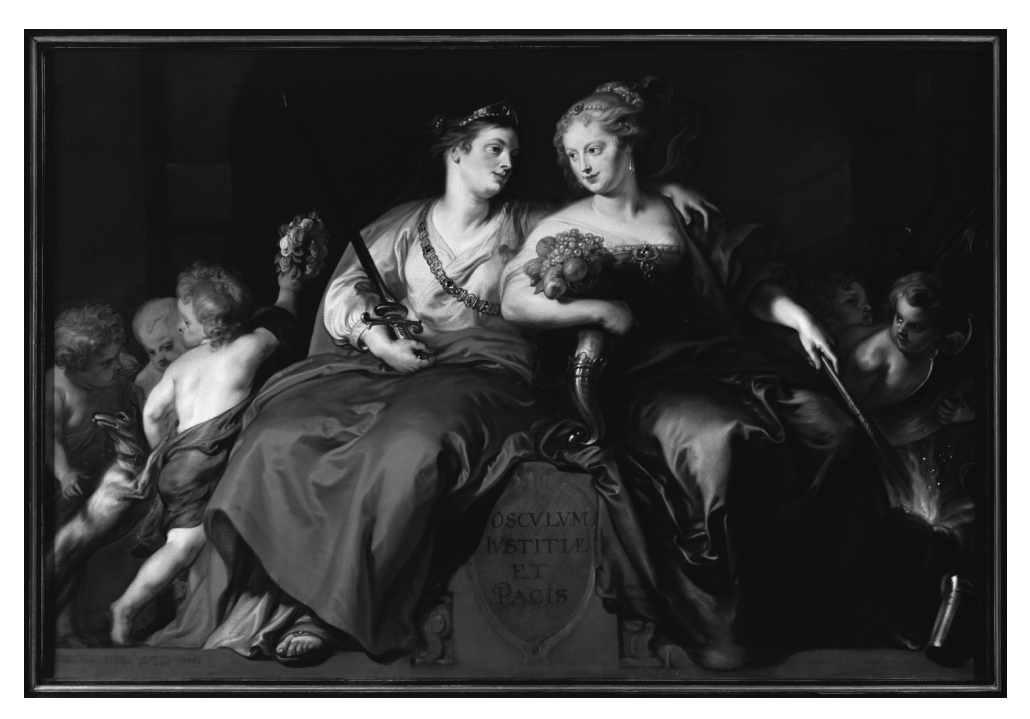
FIGURE 0.2: Theodor van Thulden, Allegory of Peace and Justice after the Thirty Years' War. Deutsches Historiches Museum, Berlin, Germany (DHM).

itself: that is, a central value with its own representations, institutions and norms, and with a constructed history as well as a constructive future. This slow movement of transformation between Westphalia and Vienna, which identified a whole culture with peace and rendered peace a cultural goal in its own right, led to forms of peace and peace-making that are recognizable up to our own time (Ghervas 2014b).