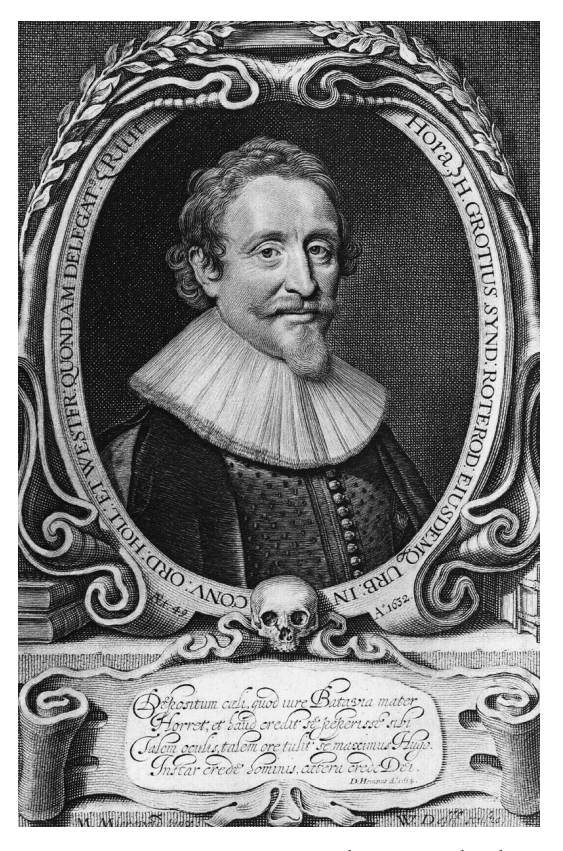
FIGURE 0.4: Delff, Hugo Grotius (1583–1645), Dutch Jurist and Politician.

society where individuals would have a direct relationship with God and their political rulers. This opposition of two sides which both considered that far more was at stake than interests of power, money, or influence, were conducive to a conflict of the worst kind: a war of mutual annihilation (which is the proper meaning of internecine war) (Armitage 2017: 93–120). The shocking cruelty and the human cost of the wars of religion in Germany— some five million deaths in the name of the love of Christ—can only be explained as the instinctive reaction of two mutually incompatible factions that both contemplated oblivion. The political war between states thus doubled as a civil war among the states of Latin Christianity, not to mention the frequent occurrence of acts of civil war (in a proper sense) between communities of the two confessions, outside of any public control (Armitage 2017). Barbarism was thus the consequence of the states' angst of an impending collapse of their social order, or the result of the actual collapse of said social order. The literature of the time, seeking signs of God's anger in natural phenomena, turned as a precedent to Jeremiah's lamentations for the destruction of Jerusalem by the Persians in the sixth century BCE (Theibault 1994). Those prophecies of doom were, alas, self-fulfilling.