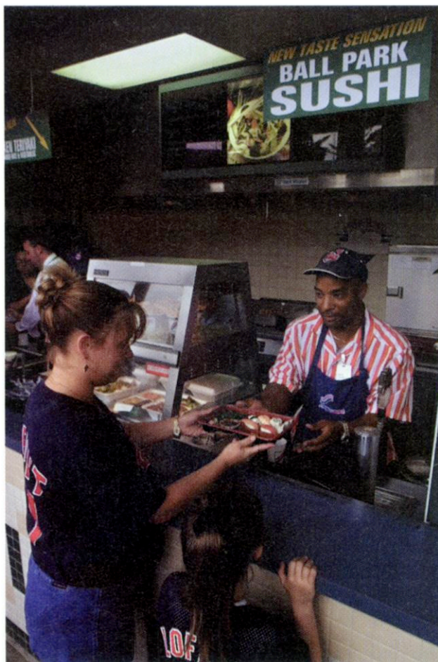
A dash of civilizations

Outside of Japan, tuna, especially raw tuna, hasn’t always had it so good. Sushi isn’t an easy concept to sell to the uninitiated. And besides, North Americans tend to think of cultural influence as flowing from West to East: James Dean, baseball, Coca-Cola, McDonald’s, and Disneyland have all gone over big in Tokyo. Yet Japanese cultural motifs and material—from Kurosawa’s The Seven Samurai to Yoda’s Zen and Darth Vader’s armor, from Issey Miyake’s fashions to Nintendo, PlayStation, and