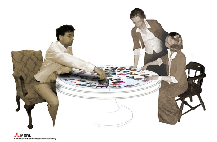
Figure 1. PDH Table.

We often find ourselves using photos to "re-connect" with people, whether it be with our family who we have not seen all day, a friend or colleague whom we have not seen in a year, or our parents who live across the country. In this paper, we describe a novel interface design for multi-person interactive informal storytelling as part of our PDH (Personal Digital Historian) project. The goal of PDH is to enable informal storytelling using personal digital data such as photos, audio and video in a face-to-face social setting. The project as a whole includes research in the areas of the design of the shared-display devices, on-line authoring, story-listening, user-guided image layout, content-based information retrieval and data mining.