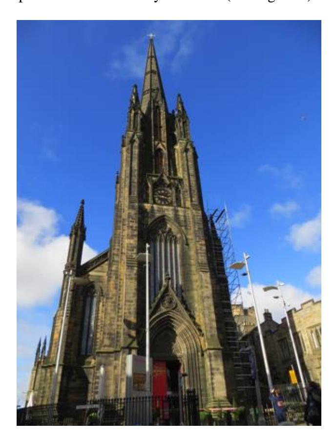
Figure 1. The Hub, the Edinburgh International Festival's headquarters

The Art of Listening program is presented on-site at the EIF's headquarters at The Hub, an architectural landmark in the city of Edinburgh—a neo-Gothic building completed in 1845 to house the General Assembly of the Church of Scotland, the Church's governing body (Edinburgh International Festival, 2014). The building was renovated in 1999 to become the EIF headquarters, and modern additions include a colorful entryway and a red stairwell fitted with hundreds of sculpted figures. The Hub sits on the Royal Mile near Edinburgh Castle, with a tall spire visible from many locations (see Figure 1).