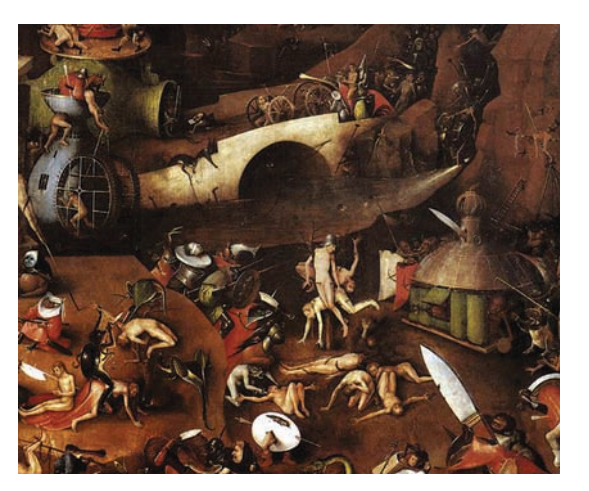
Fig. 1. This detail from The Last Judgment by Hieronymus Bosch illustrates the artist's apocalyptic vision of some of the worst that humans can think, say, or do.

Observers of human psychology have suggested that the mind can indeed generate just such ironic errors. Edgar Allan Poe called this unfortunate feature of mind the "imp of the perverse" (1). Sigmund Freud dubbed it the "counter will" (2). William James said too that "automatic activity in the nerves often runs most counter to the selective pressure of consciousness" (3). Charles Baudouin pronounced it the "law of reversed effort" (4), and Charles Darwin joined in to proclaim "How unconsciously many habitual actions are performed, indeed not rarely in direct opposition to our conscious will!" (5). Hieronymus Bosch illustrated this human preoccupation with the worst,