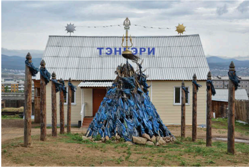
FIGURE 1 Tengeri Shamans' Center, Novaia Komushka, Ulan-Ude, Republic of Buryatia, 2012.

members of other Eurasian nationalities have been initiated, and they claim to communicate with their ancestors in their own languages rather than in Buryat.