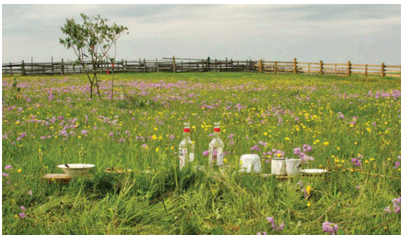
FIGURE 2 Offerings at a clan tailgan ceremony in Kabanskii district, Republic of Buryatia, 2012.

His experience represents one form of contemporary Buryat shamanism that should perhaps best be categorized