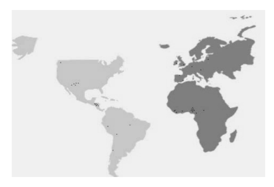
FIGURE 1 The selected points on the four continents where people of interest to the Burchard laboratory were sampled

who are posited as their Native American ancestors. For political and historical reasons Native Americans need only possess 1/8 (12.5%) demonstrable Native American ancestry, whereas Mexicans may have considerably more (Kittles & Weiss, 2003: 48). Ideas of unique and direct ancestry derived from AIMs are indeed 'contagious', spreading more or less blindly due to their compelling nature, rather than strictly 'communicative', which would require that a degree of actual knowledge inheres in the passage of information (Doyle, 1997: 3).<sup>20</sup> Here is why: in addition to the sampling quandaries and assumptions outlined above, when alleles that have a high frequency in the specific reference groups tested (those labeled African, European, Native American in Table 2) appear in a client taking the test whose ancestors may also have possessed those alleles with a high frequency, the AIMs test reads that the client, himself or herself, has inherited the specific referent ancestry (African, European, or Native American) rather than say ancestry (or SNPs) from other still unsampled parts of the globe.