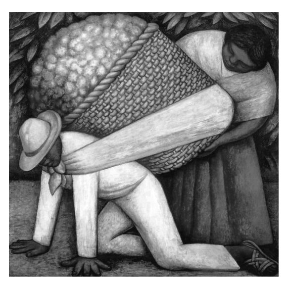
FIGURE 2 The Flower Carrier , Diego Rivera, 1935. Courtesy of the San Francisco Museum of Modern Art

where the analysis of DNA patterns takes place, is quite telling. The mural represents Tenochtitlán, the ancient Aztec capital, now Mexico City. The Aztecs were sophisticated mathematicians. Today they signify a distant source of modern Mexican origins that are presently rolled into the broader term 'Native American' for the marker panel.