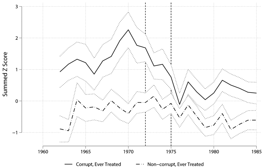
FIG. 3.—Pollution trends: corrupt and noncorrupt. The figure shows the annual trend in the average summed Z score of water pollution for corrupt and noncorrupt counties that are treated. The Z scores are calculated for each pollutant in each year (negative Z scores indicate lower than average pollution), and then Z scores for all pollutants are summed by county-year. Averages across counties are calculated by year. Treated counties are those that contain a facility that receives an NPDES permit in 1973 or 1974. Counties that contain a facility that receives a permit after 1974 are dropped. Nontreated counties do not contain a facility that received an NPDES permit between 1972 and 1985. Corrupt counties are those in states where the average number of federal convictions per 10,000 state residents is above the mean. Conviction rates are calculated as the average of the annual number of convictions per capita over the years 1976–85. Dotted lines indicate the 95% confidence interval for the average summed Z score.

We also made a pair of predictions about the relationship between pollution and corruption. First, pollution levels should be higher in more corrupt places under a liability regime, and second, regulation should reduce pollution more in such places, as in the second part of empirical prediction 3. Figure 3 indicates that both of these predictions hold in our data. In figure 3, we show the level of pollution in treated corrupt and treated noncorrupt counties. As predicted, pollution levels in corrupt counties are substantially higher before 1972 than in noncorrupt ones. Moreover, levels in corrupt counties fall precipitously after 1972 and are substantially closer to levels in noncorrupt counties by the late 1970s. Table 1 confirms the findings in figure 3 and shows that they are statistically highly significant.