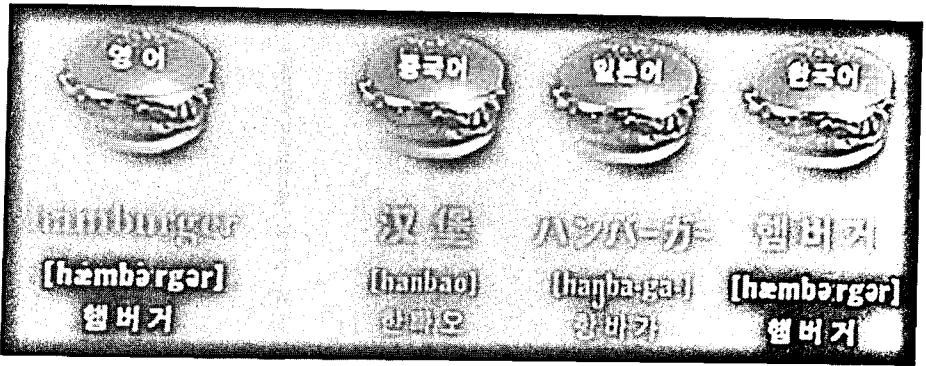
Figure 28.1 National Museum of Korea, video exhibit. Photo by Nicholas Harkness, 2006. 12

distinctive features of Korean phonology (see Harkness 2012, 365–366 for a full discussion).