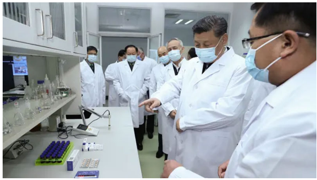
Chinese President Xi Jinping learns about progress on a vaccine at the Academy of Military Medical Sciences in Beijing, 2 March.

Even at their most effective - and draconian - containment strategies have only slowed the spread of the respiratory disease coronavirus (http://Coronavirus: 11 popular questions, answered) or Covid-19. With the World Health Organization finally declaring a pandemic, all eyes have turned to the prospect of a vaccine, because only a vaccine can revent people from getting sick.