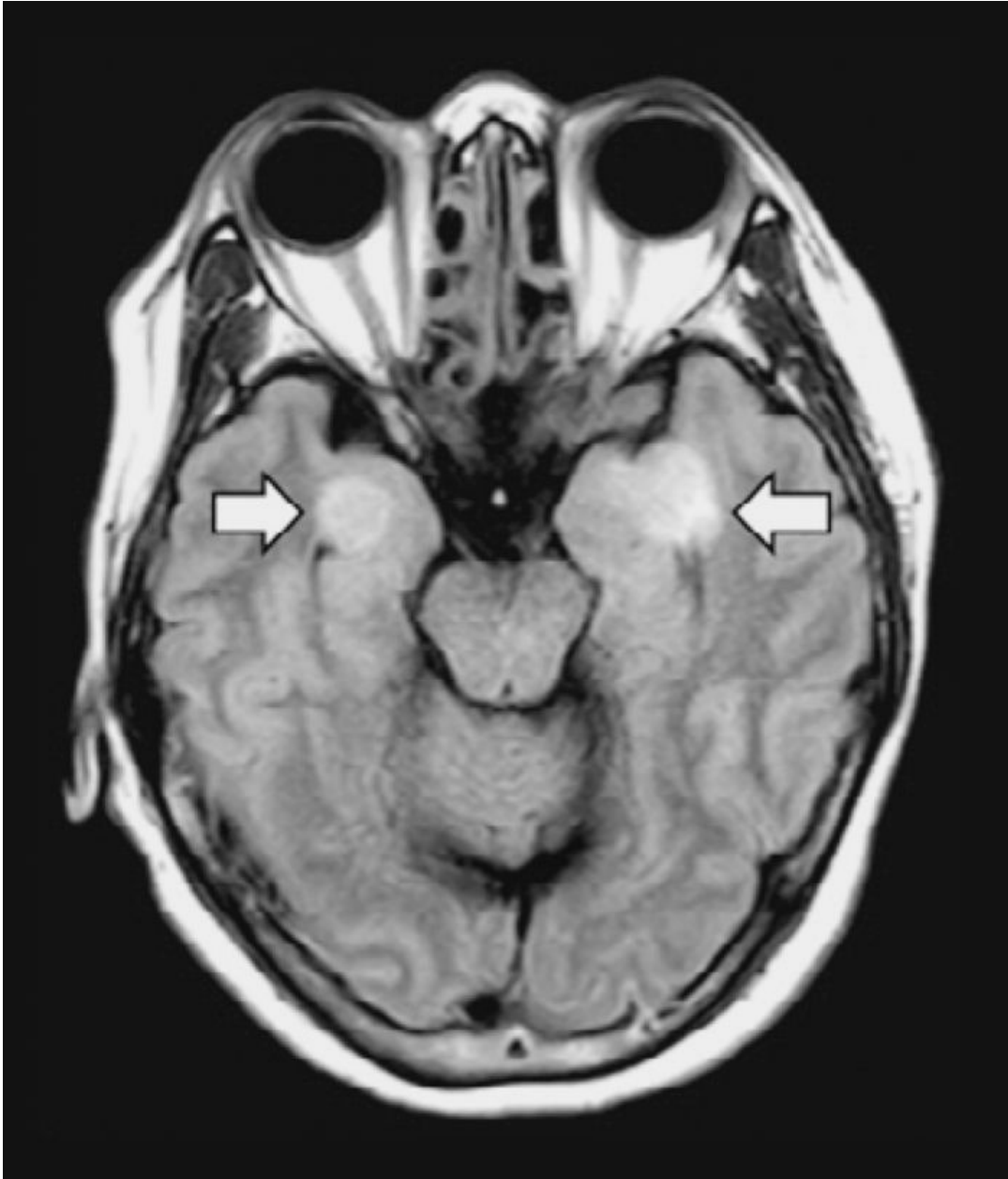
A 58-year-old woman with COVID-19 developed encephalitis, resulting in tissue damage in the brain (arrows).

But other factors could be damaging the brain. For example, a cytokine storm could cause brain swelling, and the blood's exaggerated tendency to clot could trigger strokes. The challenge now is to shift from conjecture to confidence, at a time when staff are focused on saving lives, and even neurologic assessments like inducing the gag reflex or transporting patients for brain scans risk spreading the virus.