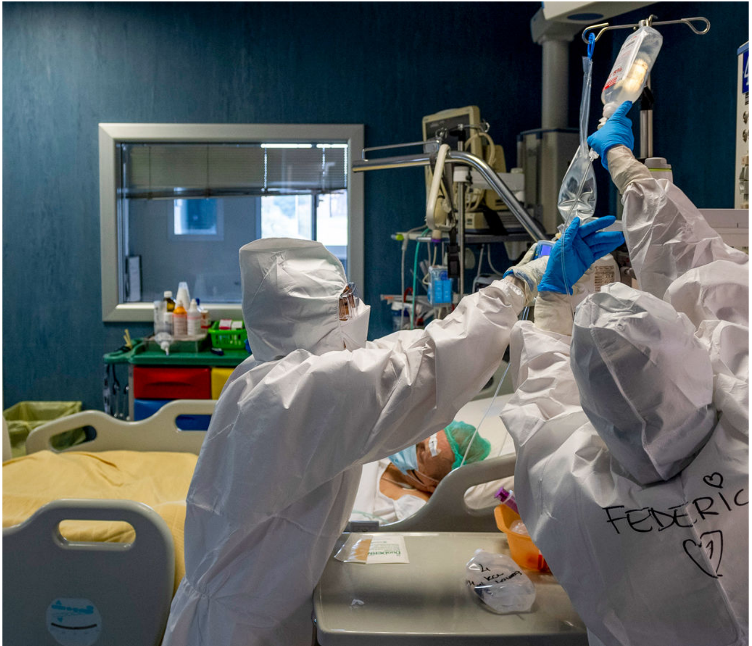
Medical staff work to help a COVID-19 patient in an intensive care unit in Italy.