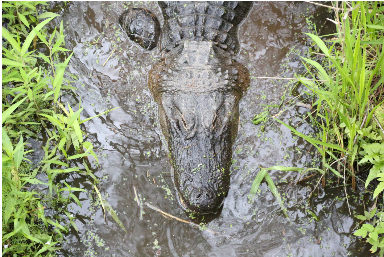
American Alligator. Baldwin County, Alabama.

My Chinese cousins near Yangtze River valley are more endangered They are smaller in the wild and now most are found in zoos