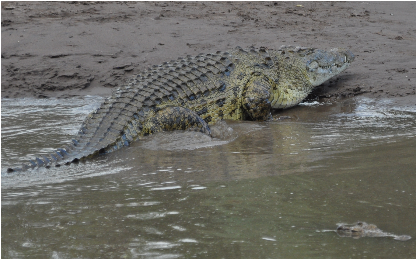
Crocodile. Maasai Mara National Reserve, Kenya. Content and photo by K. Lee Lerner. ©LMG. All rights reserved.

Crocs have V-shaped snouts Sharper teeth and toothy grin Found around the world Crocs tolerate saltwater excrete salt through lingual glands