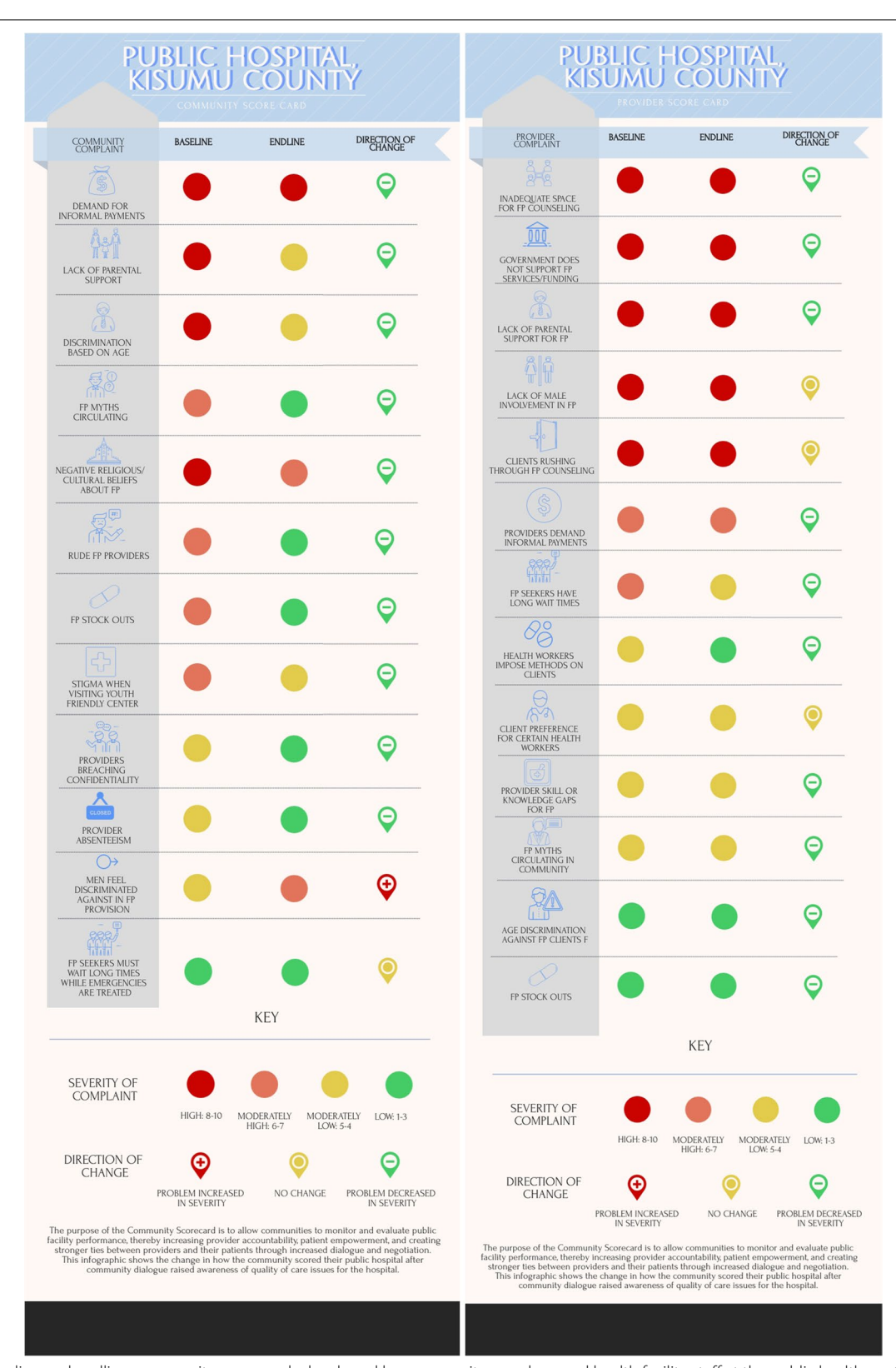
Fig. 3 Baseline and endline community score cards developed by community members and health facility staff at the public health center in Kisumu County