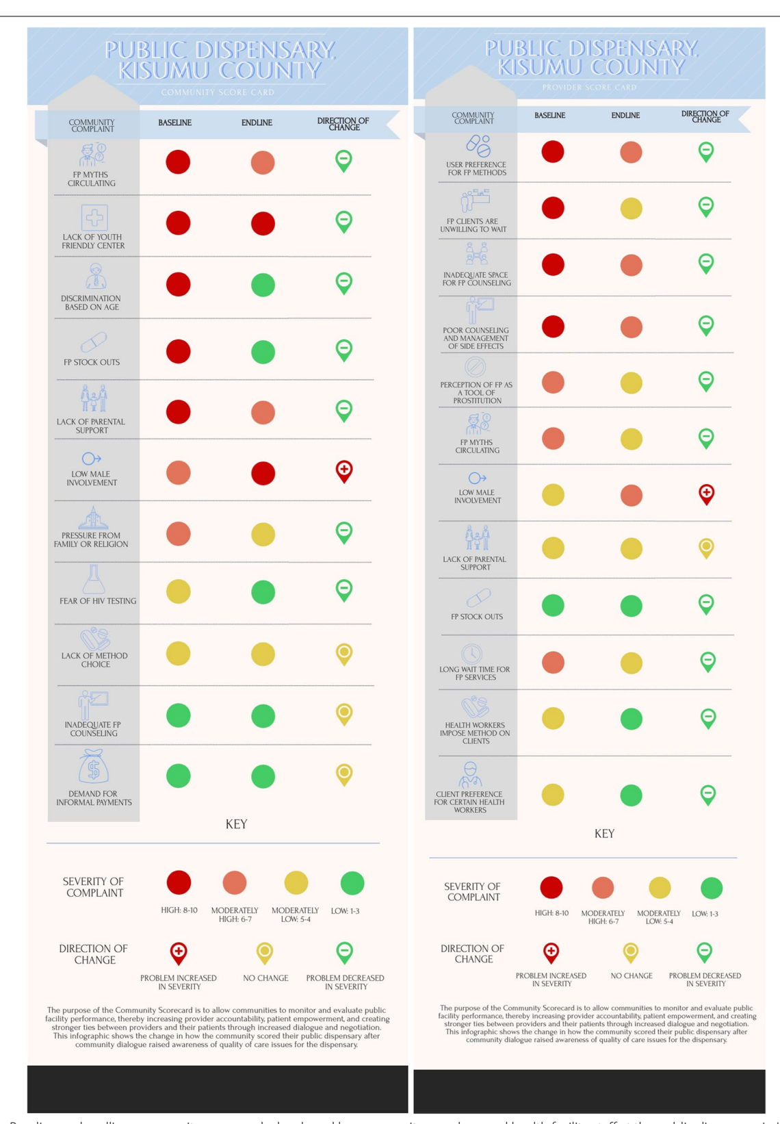
Fig. 1 Baseline and endline community score cards developed by community members and health facility staff at the public dispensary in Kisumu County