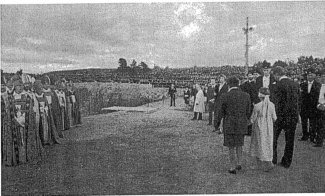
Religious leaders, schoolteachers, learned men, and the masses watch as a young girl's parents lead her to the edge of a cliff and push her off in a scene titled "The Sacrifice" in Sånger från andra våningen [Songs from the Second Floor] (2000)