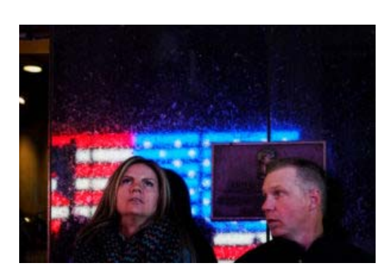
How It Happened Elizabeth Drew