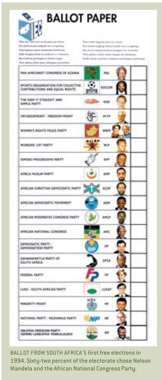
BALLOT FROM SOUTH AFRICA'S first free elections in 1994. Sixty-two percent of the electorate chose Nelson Mandela and the African National Congress Party.

On the Robustness of Majority Rule and Unanimity Rule. Partha Dasgupta and Eric Maskin. Available at www.sss.ias.edu/papers/papers/econpapers.html