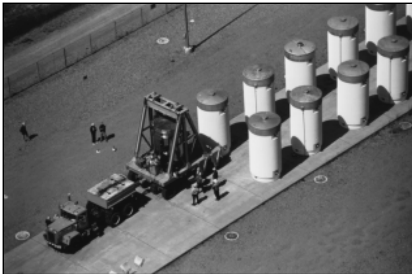
Figure 2.2: Concrete storage casks at a U.S. nuclear power plant

In a cask system, a flat concrete pad is provided (either outdoors or within a building), and large casks that contain the spent fuel can be added as needed to store the amount of fuel required. The casks provide both shielding and containment. The initial cost of establishing the facility is small, and the operating costs once the fuel is loaded are also small, but the capital cost of the casks themselves is significant; as each cask costs roughly the same amount as previous casks, there are few economies of scale in storing more fuel. For an at-reactor facility, the fuel can typically be moved from the pool to a dry cask using primarily fuel handling equipment already available at the reactor site. A wide variety of specific cask designs are available from several manufacturers, including both metal and concrete casks (the latter typically having metal inner liners). 12 Originally, like vaults and silos, casks were designed only for storage (so-called “single purpose” casks). More recently, some cask designs have been