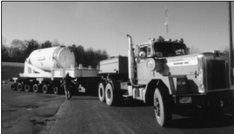
Figure 2.4: A spent fuel cask loaded on a truck for transport

Recently, the NRC has published detailed new analyses suggesting that the risk is even lower than their previous studies had concluded. 42 In the United States, for example, in roughly 1300 commercial spent fuel shipments between 1979 and 1995 (1045 by highway and 261 by rail), there were 8 accidents, none of which damaged the fuel casks, compromised the shielding, or caused any release of radioactive material. 43 Worldwide, over 88,000 tonnes of spent fuel had been shipped by 1995 by sea, road, and rail, with an excellent safety record. 44 It seems clear that the