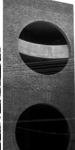
Brick circular cutaway, Louis Kahn's Indian Institute of Management in Ahmedabad, 1988