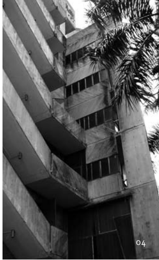
Exterior fire escape on east side of building, Satabhandhu's Building 9