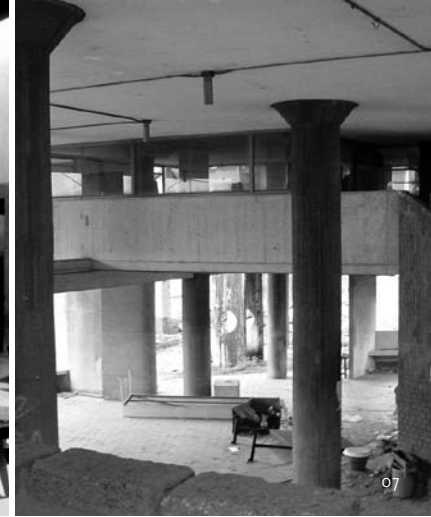
Mushroom capitals, Satabhandhu's Building 9

decision relates more to the traditions of the vernacular Thai house; rather than using the ground floor's openness solely for the sanitary reasons that Corbusier prescribed, 4 Ongard opened the entire space for natural indirect lighting, ventilation, and social activities – traditions inherent in Thai culture. 5 Its multi-purpose program was enriched by the integration of stairs, benches and tilted walls to encourage active use, appealing to the Thai preference for outdoor public spaces. When configuring the classroom arrangement, Ongard offered an alternative to the conventional Thai school design of single-loaded corridors of classrooms terminating in administration. By separating the classroom from the faculty area, Building Nine modified the traditional Thai student-teacher relationship to encourage more self-discipline among the student body. Finally, Ongard's regionalized alterations extended to the landscape, as he eschewed Le Corbusier's use of massive concrete plazas (found at Chandigarh and elsewhere) in favor of tree-lined public spaces that created a pleasant student atmosphere while lowering the ambient temperature. 6