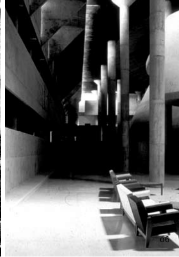
Mushroom capitals, Le Corbusier's Chandigarh Assembly Hall, 1961