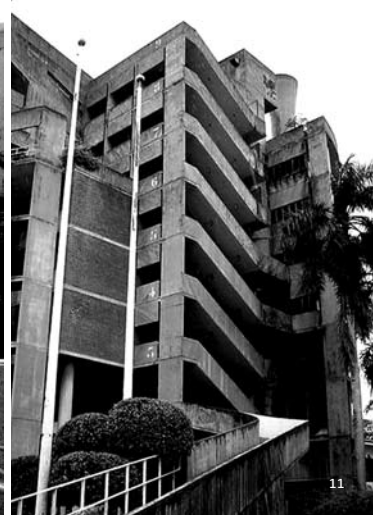
Entrance ramp, Satabhandhu's Building 9