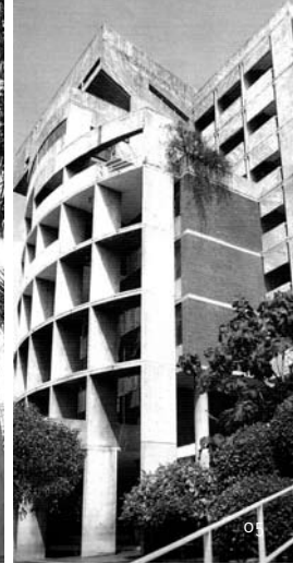
Ongard Satabhandhu's Building 9 at Panabhandhu School, 1969