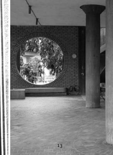
Brick circular cutaway, Satabhandhu's Building 9