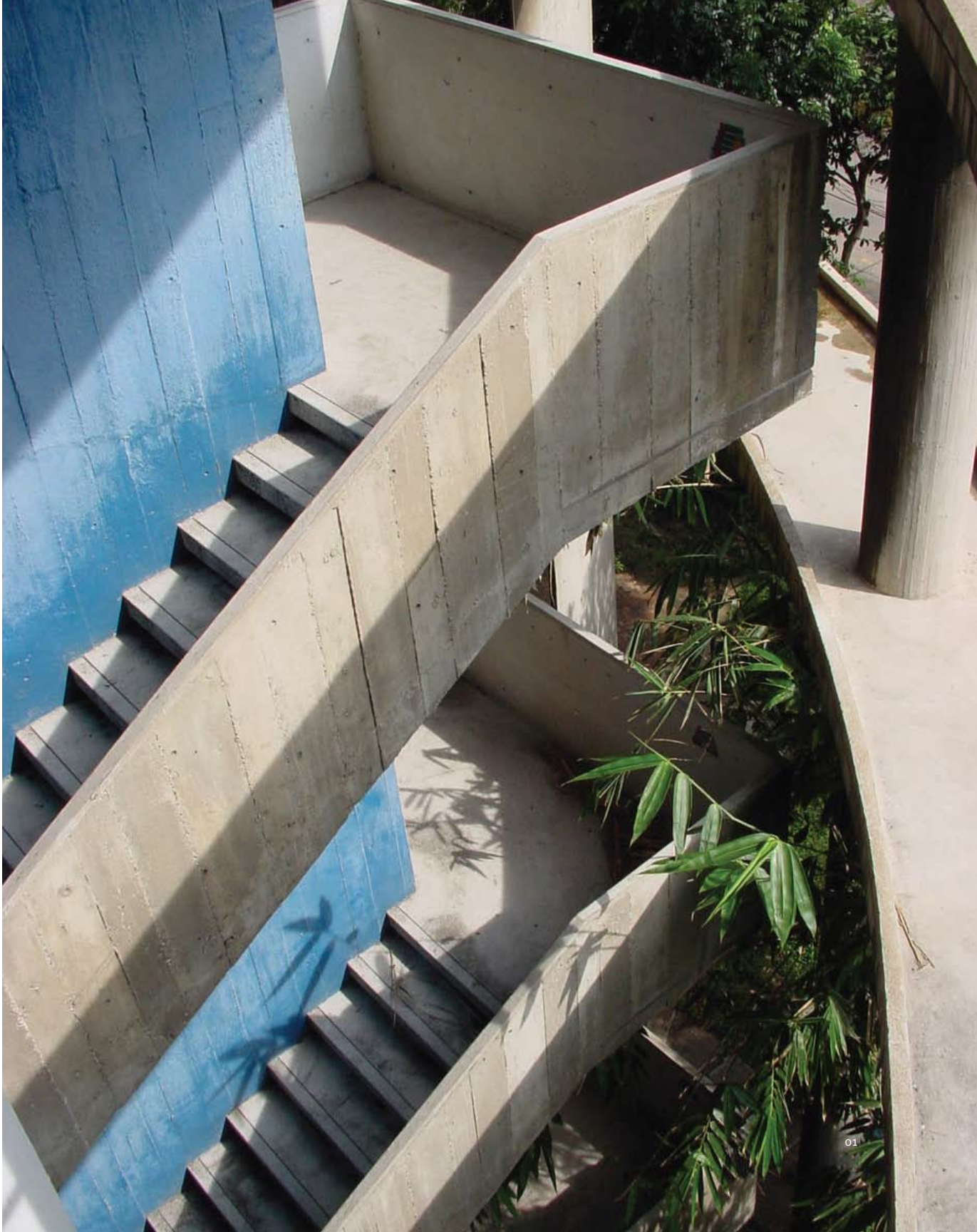
01: Expanded Embassy shading system, Satabhandhu's Building 9