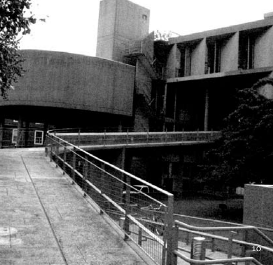
Entrance ramp, Le Corbusier's Carpenter Center of Visual Arts at Harvard University, 2005