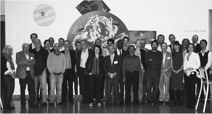
Figure 2. Participants in “The Global E.P. Thompson” conference hosted by the Weatherhead Initiative on Global History and the Program on the Study of Capitalism, Harvard University, October, 2013.

Scholars from most corners of the world responded to our call for papers, interested in assessing the way Thompson’s work was understood, appropriated, given meaning, or in some cases ignored or critiqued in particular national contexts.