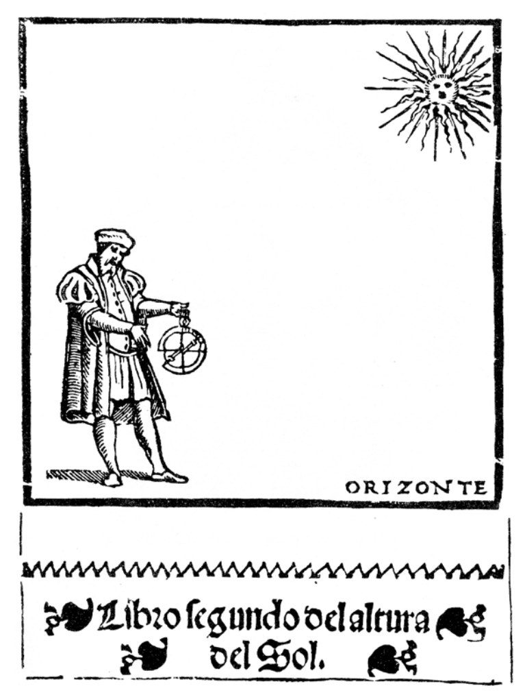
Figure 13.4 Man using a mariner's astrolabe to measure the altitude of the sun, from Pedro de Medina, Regimiento de navegacion (1552).

behold and mathematically sophisticated, astrolabes were prized for their utility. They could be used to find time, direction, and latitude, to observe stars and planets, to know risings and settings, to cast horoscopes and teach astronomy, to perform mathematical calculations, and to conduct surveys. Within 300 years of Radolf's letter, astrolabes were more widely diffused throughout Europe, North Africa, and the Middle East, but they remained too costly and complicated to be commonly carried on the roads or seas, despite their apparent usefulness. When they traveled, they were the precious baggage of an astronomer or noble collector. It was not until the late fifteenth century, when Portuguese monarchs had strong economic and political incentives to equip their ships with astrolabes and mathematically trained navigators that astrolabes traveled widely and often.