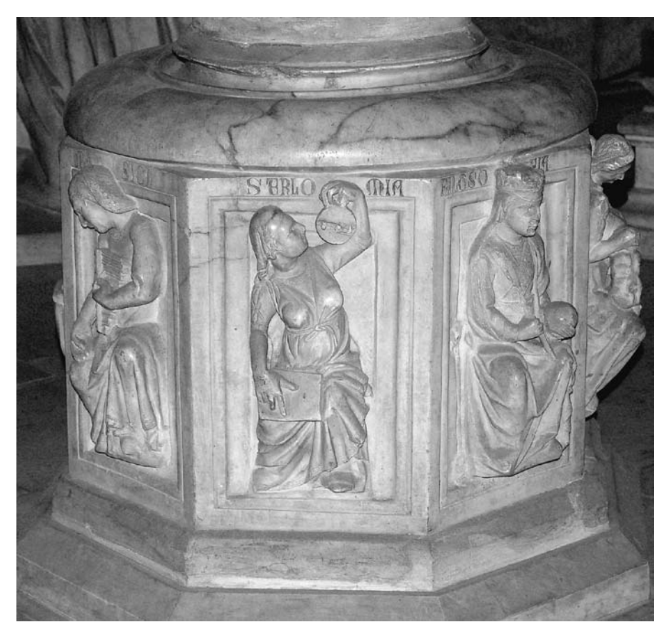
Figure 13.3 Astronomy represented by a muse holding an astrolabe, sculpted from marble by Giovanni Pisano in 1302 on the central supporting column of the pulpit for the Duomo of Pisa.

Astrolabes made quick work of finding the time during the day or night using observations of the altitude of the sun or a fixed star. The instrument could also be used to compute the duration of daylight or darkness on a given day, and so could provide a traveler with knowledge of the number of hours available for that day's journey. Moreover, many astrolabes demarcated time in both unequal and equal hours, thereby allowing a conversion between the time-telling systems that were favored by monks and rural workers on the one hand, and by astronomers on the other.<sup>11</sup> With the introduction of the mechanical clock in the fourteenth century, equal hours became preferred by workers in urban areas because they tracked time in a similar fashion to tower clocks. It would be wrong, however, to say that the astrolabe was essential for time finding by travelers moving between the countryside