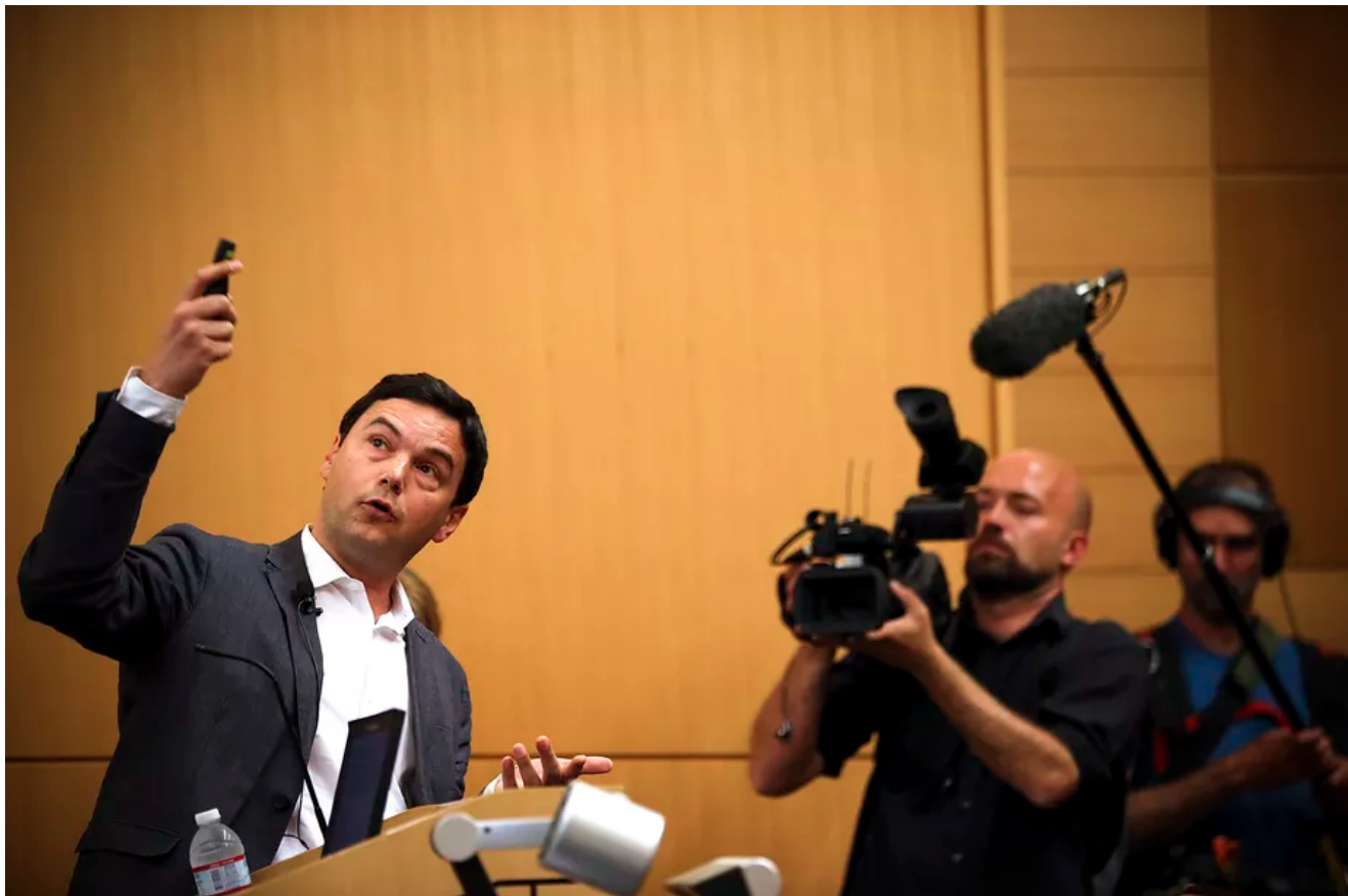
Thomas Piketty, one of a group of French economists who have made heavy taxes on the rich intellectually respectable.

This argument is important for estate taxes as well, as they are also a kind of capital tax. A 2013 paper by Piketty and Saez made this argument explicitly, arguing that the optimal inheritance tax rate was something like 50 to 60 percent, and possibly even higher for the very rich.