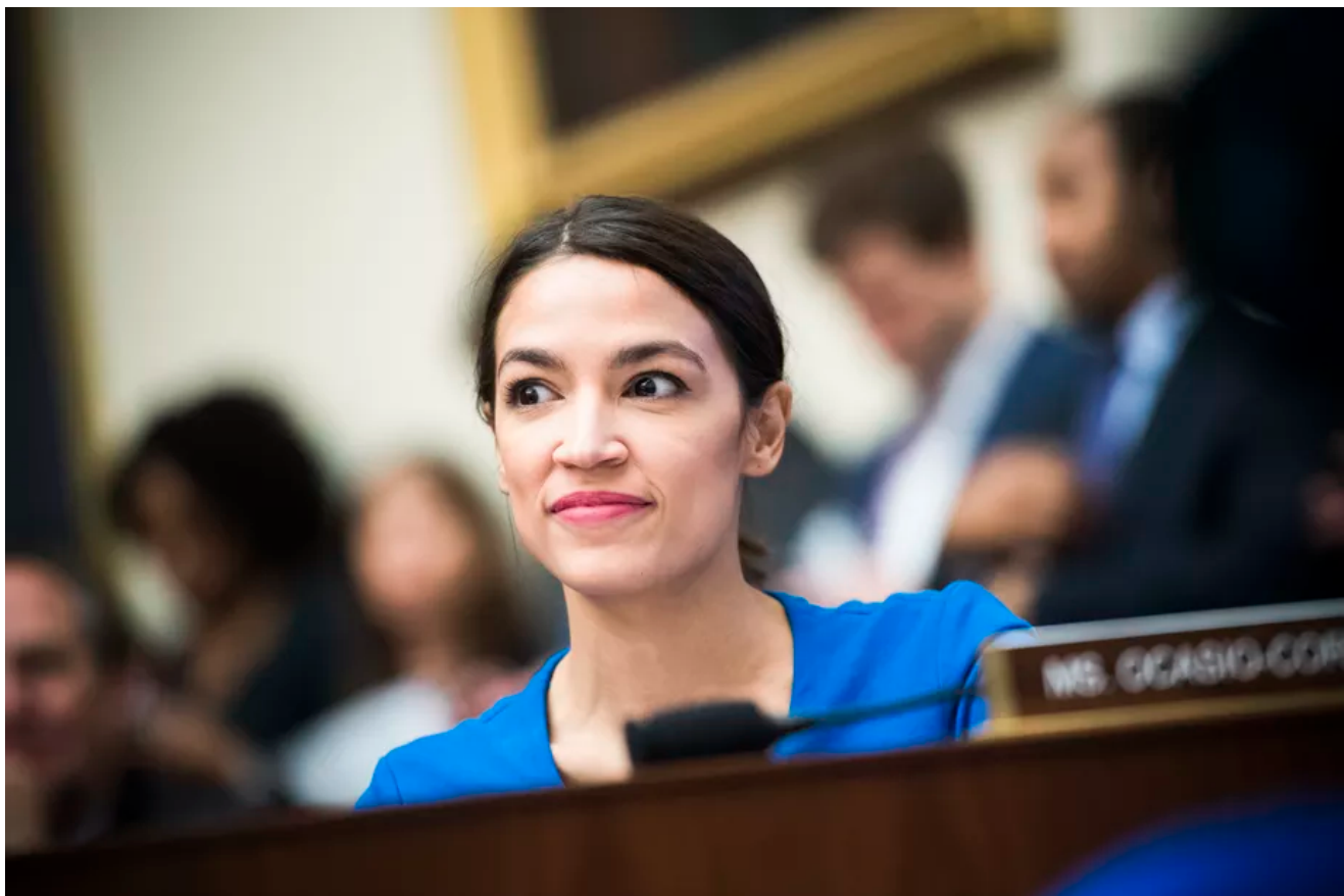
Rep. Alexandria Ocasio-Cortez (D-NY) moved the Overton window considerably on top income tax rates.

All of this adds up to a comprehensive intellectual case for the proposals that Ocasio-Cortez, Sanders, and Warren are floating: much higher income and estate tax rates, and perhaps an annual wealth tax as well.