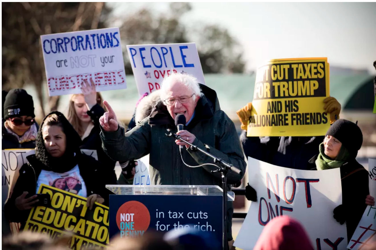
Sen. Bernie Sanders (I-VT) has proposed the most aggressive estate tax plan of any 2020 candidate.

All of which is to say: Democrats have gotten to the first stage in the tax-the-rich process. They're sketching out broad ideas that poll well and offer red meat to primary and caucus voters for 2020. And they haven't yet committed to approaches to handle these implementation details, like tracking wealth, taxing capital income as it's earned, and taxing inheritances rather than estates.