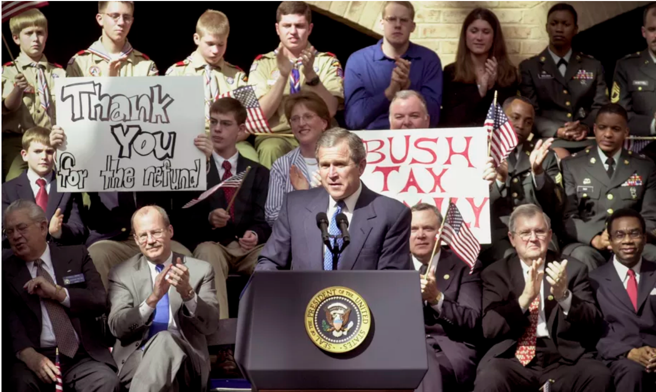
President George W. Bush during a five-day, two-state trip through Arkansas and Georgia promoting his $1.6 trillion tax cut, on March 1, 2001.

Obama proposed other measures to increase taxation on top earners that Congress never gave a hearing, but they were modest compared to the ideas that Sanders, Ocasio-Cortez, and Warren are floating now. His two principal ideas were the “Buffett Rule” — a minimum tax rate of 30 percent for people with $1 million-plus in income, inspired by Warren Buffett — and a cap on itemized deductions and exclusions . The Buffett Rule would’ve dramatically increased the tax rate on investment income , but only to the mid-30s range. Neither plan would’ve raised the top rate on wage income to anything like its historic highs.