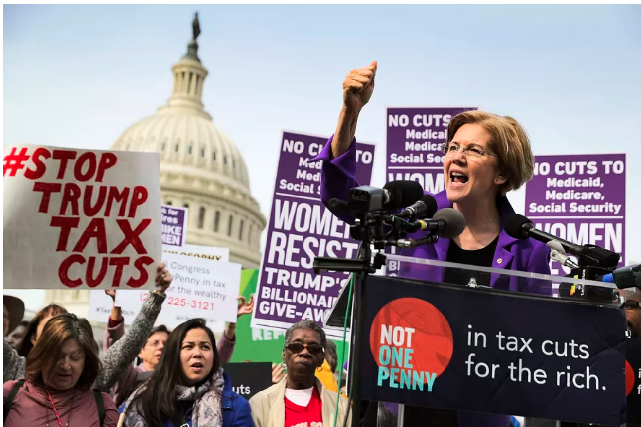
Sen. Elizabeth Warren (D-MA) recently became the first major American politician to propose an annual wealth tax.

But Sanders, Warren, and Ocasio-Cortez's proposals are significantly more ambitious; Warren, for instance, is proposing a kind of tax the federal government has never imposed before, breaking totally new ground.