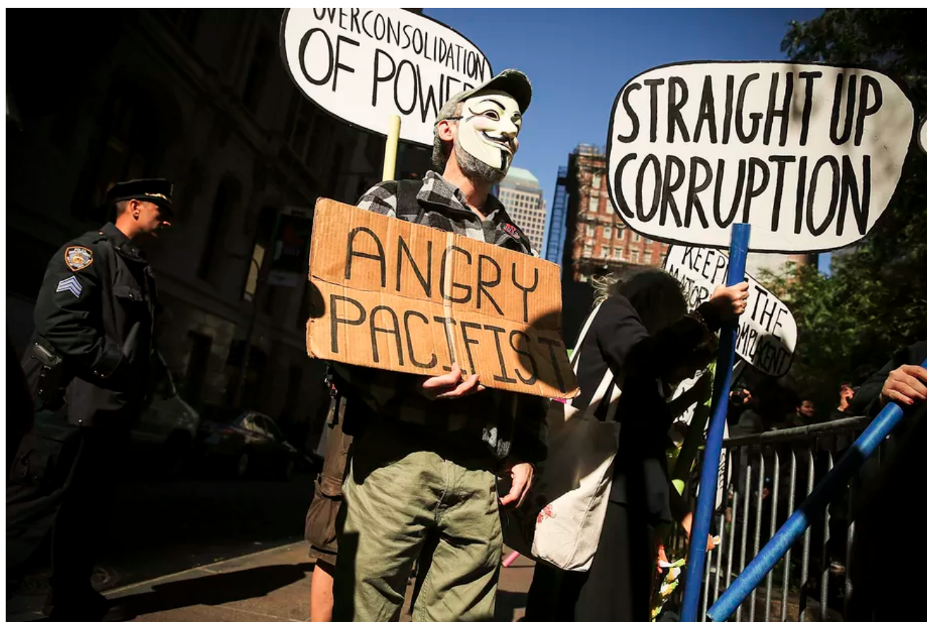
Activists with Occupy Wall Street protest income inequality near the New York Stock Exchange on the second anniversary of the movement on September 17, 2013, in New York City.

Democrats? There's the Great Recession, in which bankers were bailed out as high unemployment persisted for years; and the Occupy movement, which made economic inequality a core national issue in 2011 and onward.